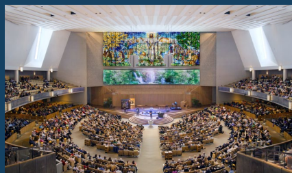
General sessions will be in Resurrection's newly opened Sanctuary